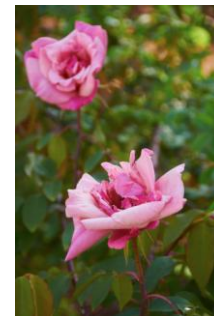
Rosa 'La Follette' Monserrate Rose Garden

“This event has been organised to reveal the unique character of gardens in Portugal, through their history, current projects and their future potential.”